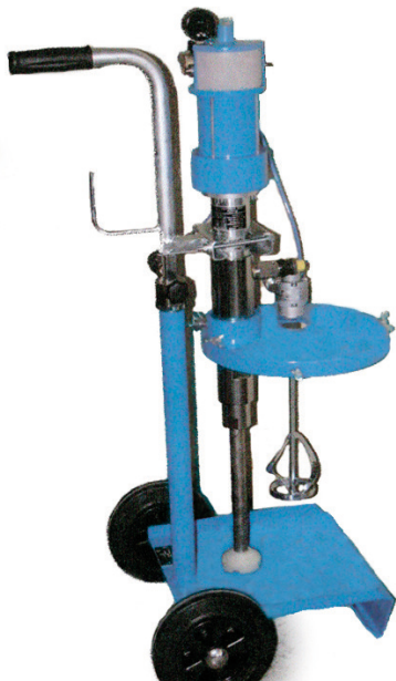
WIWA Low Pressure Pump DA

Foundry washes create a sealed surface between the sand and metal necessary to allow the release of the piece from the form after casting. Black wash is applied through spraying in the fluid state using a WIWA Low Pressure Pump DA 10:1. Either Styrofoam or sand models can be coated. The coating serves to eliminate the rough finish of the form and core to produce smooth casting surfaces. Through the application of the wash using WIWA Airless technology (airless spraying), significantly less overspray is produced as compared to air-assisted systems. WIWA equipment technology for spraying black wash with various solids content.