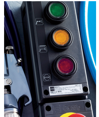
Explosion-proof system remote control