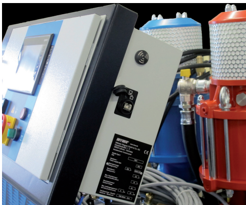
FLEXIMIX control box with interface

Operation is easily and quickly learned thanks to a 5 inch touch screen display in colour. All operating elements such as the pressure adjustment of material pumps, flush pump and atomizer air, together with the USB port and the high pressure filters, are located at the front of the device and can be centrally accessed as a result of the new design. All material conducting parts of FLEXIMIX 1 and 2 are non-corroding, which means water-based paints can be easily processed. Dosing of the catalyst is easily adjustable to suit the mixing ratio and the material characteristics. Due to the closed design of the valves and the included release agent, Isocyanate can be processed without crystallization problems. The modular design of the dosing unit with minimal spacing between valves enables fast color changes with minimal use of solvent. With the new multi function rack, the system can be upgraded with optional accessories e.g. material flow heaters, feed containers, flush pumps or other material pumps. If requested, a mobile multi function rack can be supplied. The new WIWA FLEXIMIX system enables the use of every application method such as Airless, Air-Combi, HVLP and electrostatic, as well as the conventional spraying methods. The WIWA FLEXIMIX is also available as a 3K-unit