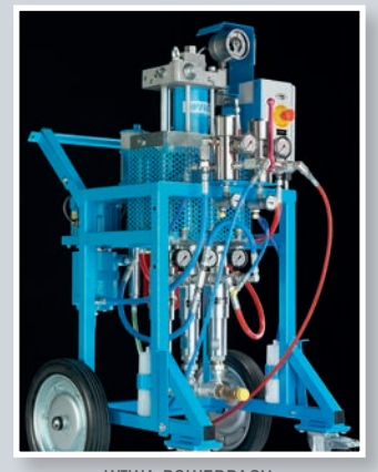
WIWA POWERPACK 2K XXL hydraulic systems