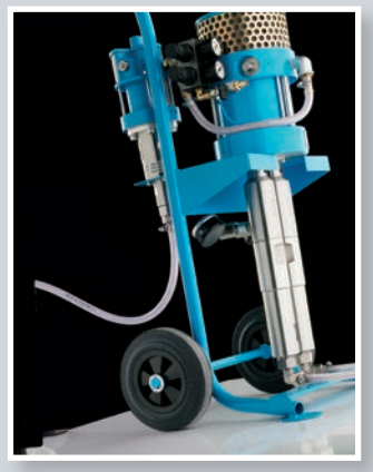
WIWA DUOMIX 2K airless paint spraying systems