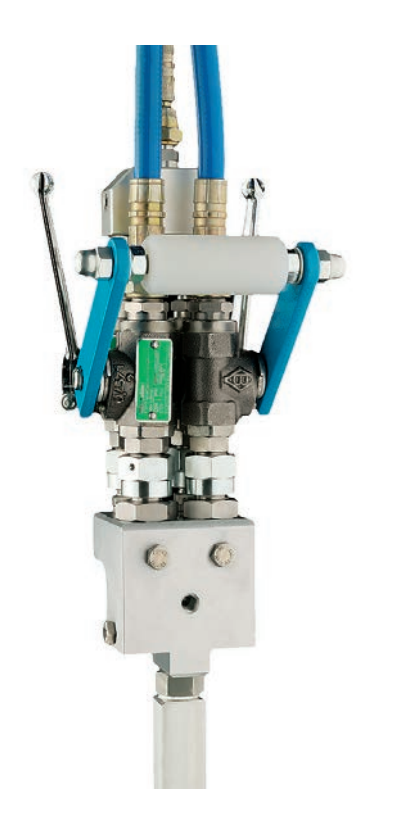
Mixing unit complete with staticmixer and separate flush assembly for the A and B components