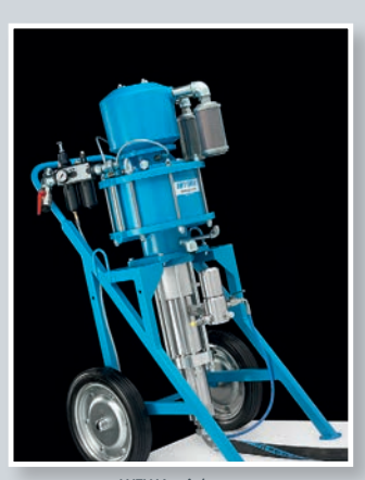
WIWA airless, air combi and hot spray systems