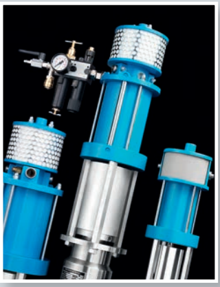
WIWA material feed pumps for almost every application field