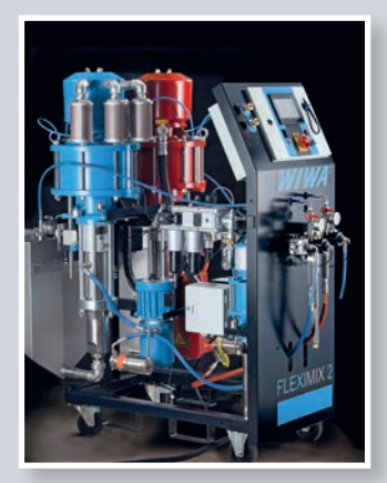
WIWA FLEXIMIX, electronic 2K painting and coating systems