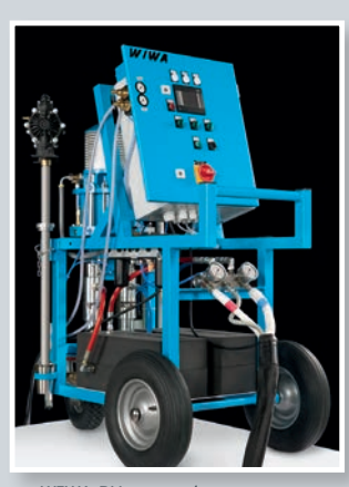
WIWA PU 460 polyurea systems