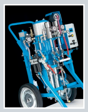
WIWA DUOMIX 2K airless paint spraying systems