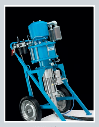
WIWA airless, air combi and hot spray systems