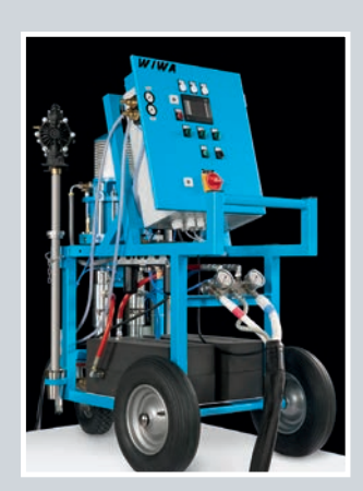
WIWA PU 460 polyurea systems