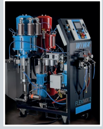
WIWA FLEXIMIX, electronic 2K painting and coating systems