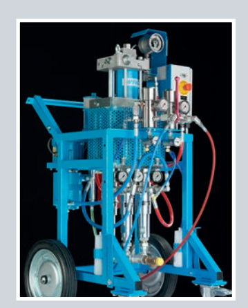
WIWA POWERPACK 2K hydraulic systems