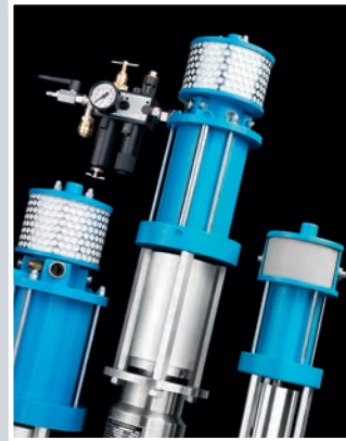
WIWA material feed pumps for almost every application field