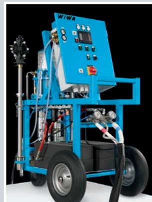
WIWA PU 460 polyurea systems