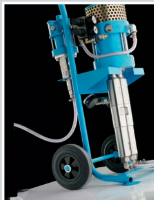
WIWA DUOMIX 2K airless paint spraying systems