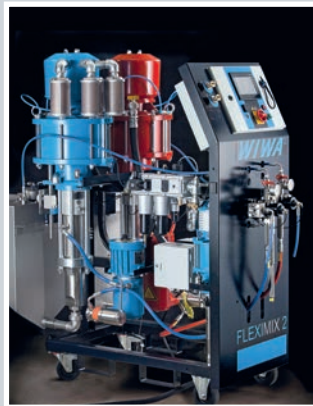
WIWA FLEXIMIX, electronic 2K painting and coating systems