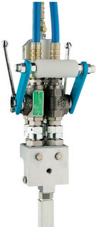
Mixing unit complete with static mixer and separate flush assembly for the A and B components