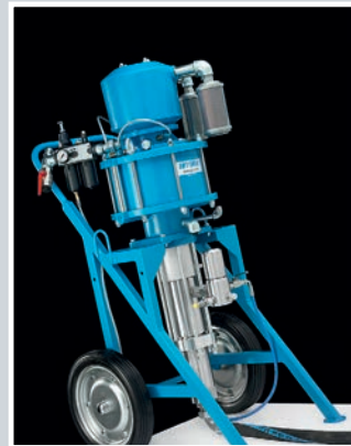
WIWA airless, air combi and hot spray systems